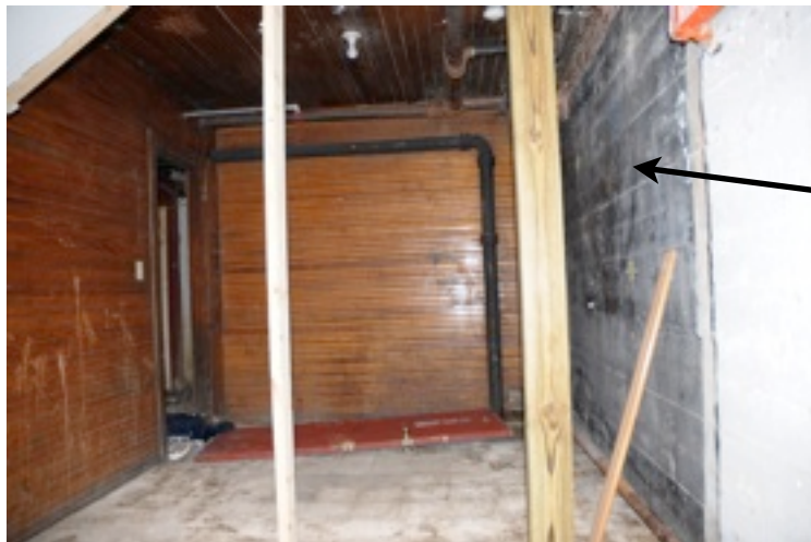
This side shot in to the Foose Room was taken on Aug. 8, 2009.