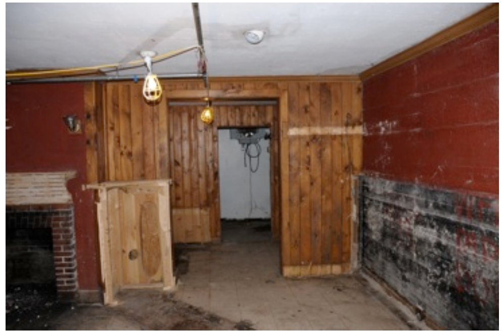
Looking into the bar/walk-in area Aug. 18, 2009