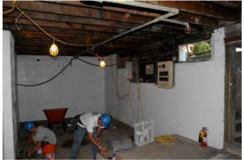
The new, cleaned up and repainted Boiler Room area. Sept. 1, 2009