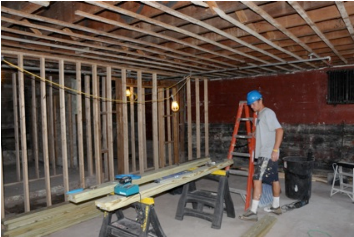
Construction down in the old Party Room where the bar used to be. Sept. 1, 2009