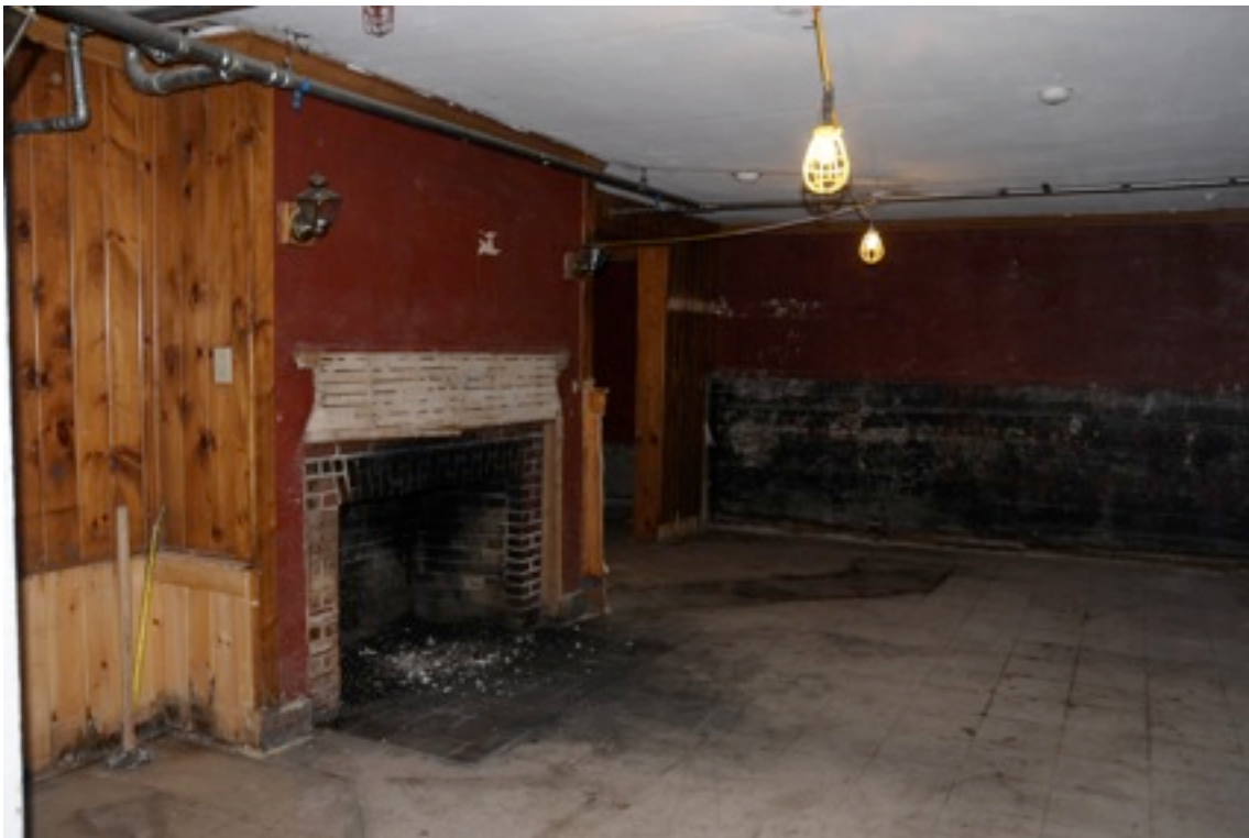
Old Party Room on Aug. 18, 2009