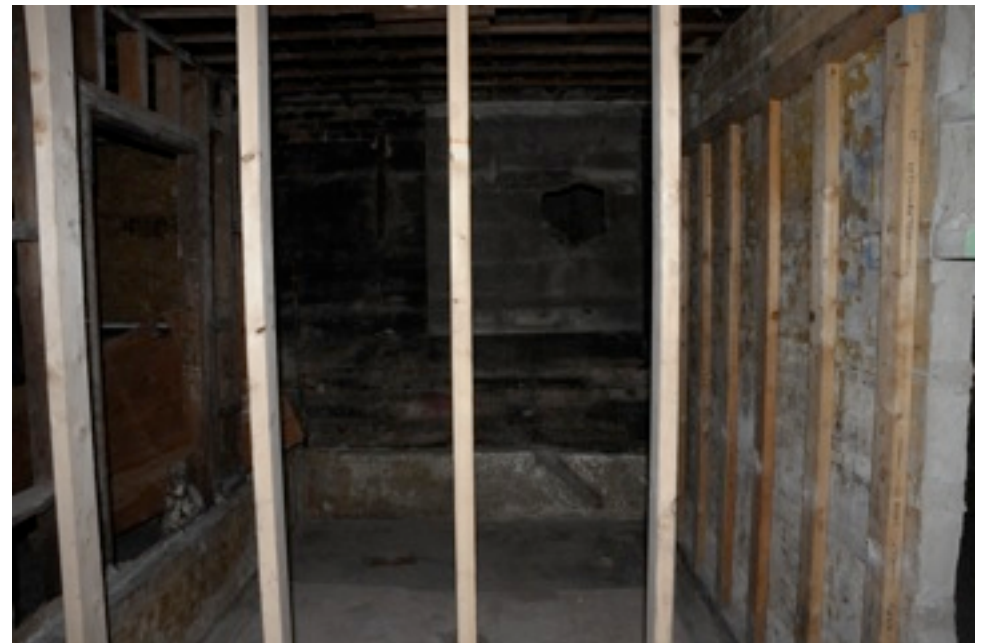
Looking into the walk-in area