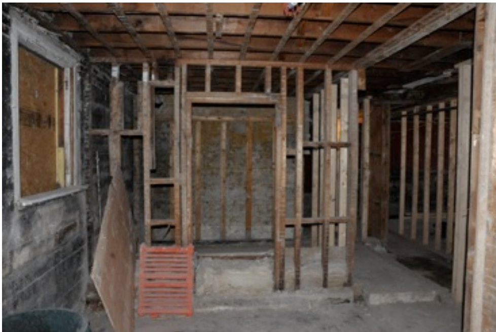
Looking into the old shower area from underneath the stairs.