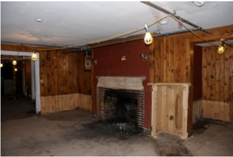
Last look at the Party Room fireplace Aug. 18, 2009