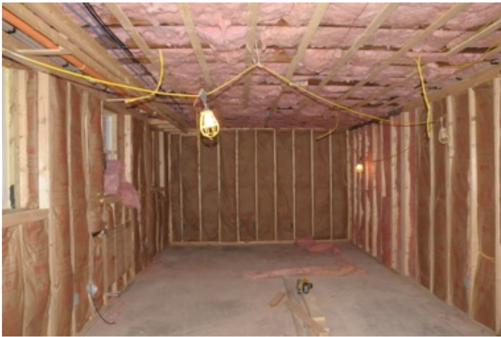
Check out how much insulation was put in downstairs! Awesome.