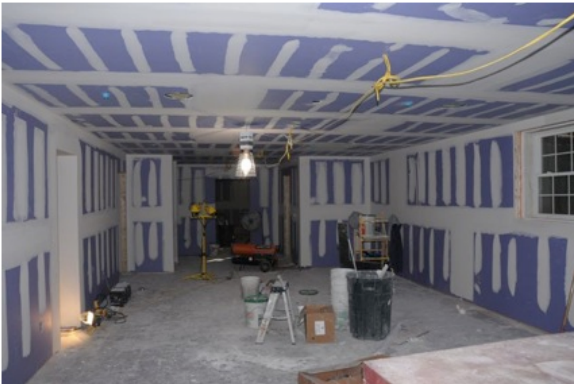
The view from the back of the party room towards the old bar area, stairs on the left.