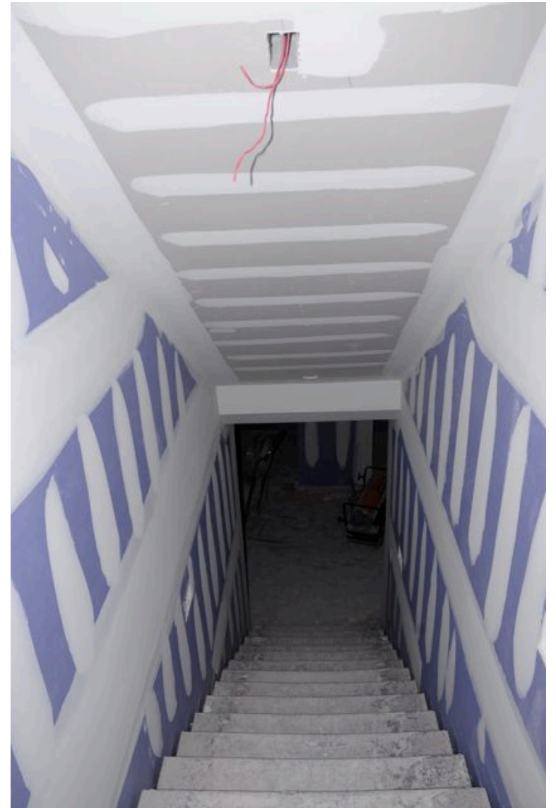
Stairway to basement on Jan. 4, 2010