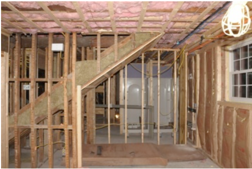
Framing and insulation below stairs to basement in Late November.