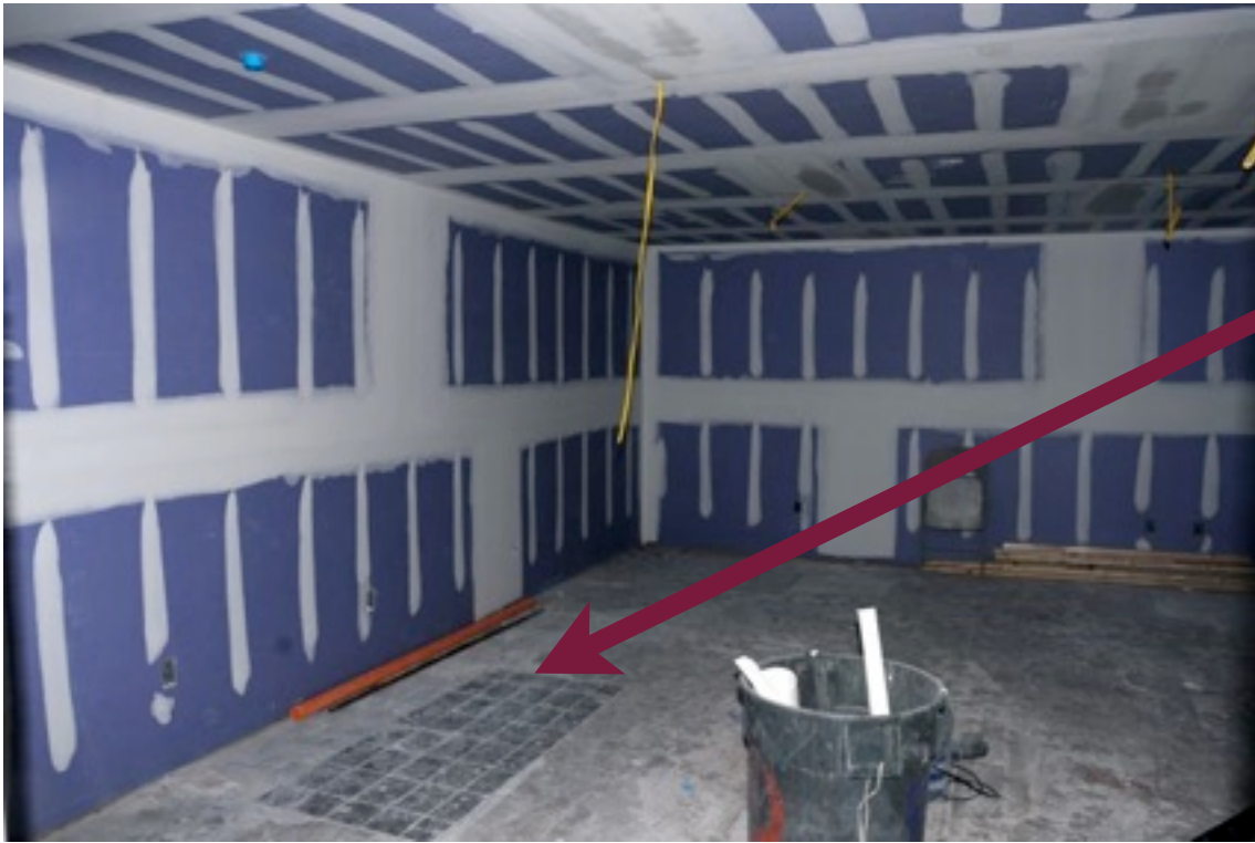
Party Room Jan. 4, 2010 You can see the bricks are still in the floor where the fireplace used to be.