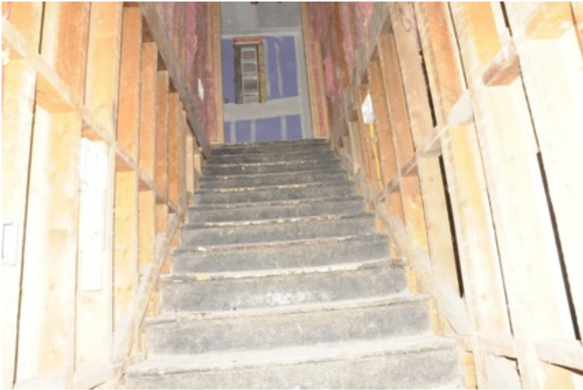
these stairs always look nasty and have had a tough 88 years.